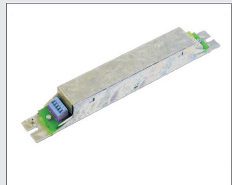
■ dali one relay product ref: 208A1

The unit derives its power from the incoming 230V circuit. Integral LEDs indicate power & diagnostic functions while a selector switch configures the relay for control of normal lighting or discharge lighting (inhibiting frequent switching).